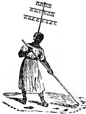
A WOMAN WITH IRON HORNS AND BELLS ON, TO KEEP HER FROM RUNNING AWAY.